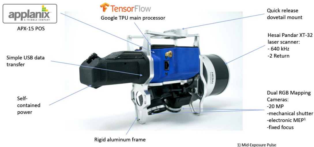
Figure 1: True View 515

The True View 515 is a compact 3D Imaging Sensor (“3DIS”) designed for small Unmanned Aerial Systems (sUAS or drone). It comprises a laser scanner with dual photogrammetric cameras that have been carefully configured to provide a fused LIDAR/imagery field of view (FOV). The system includes full post-processing software that generates a ray-traced 3D colored point cloud (hence the name “3D Imaging Sensors”) and geocoded images.